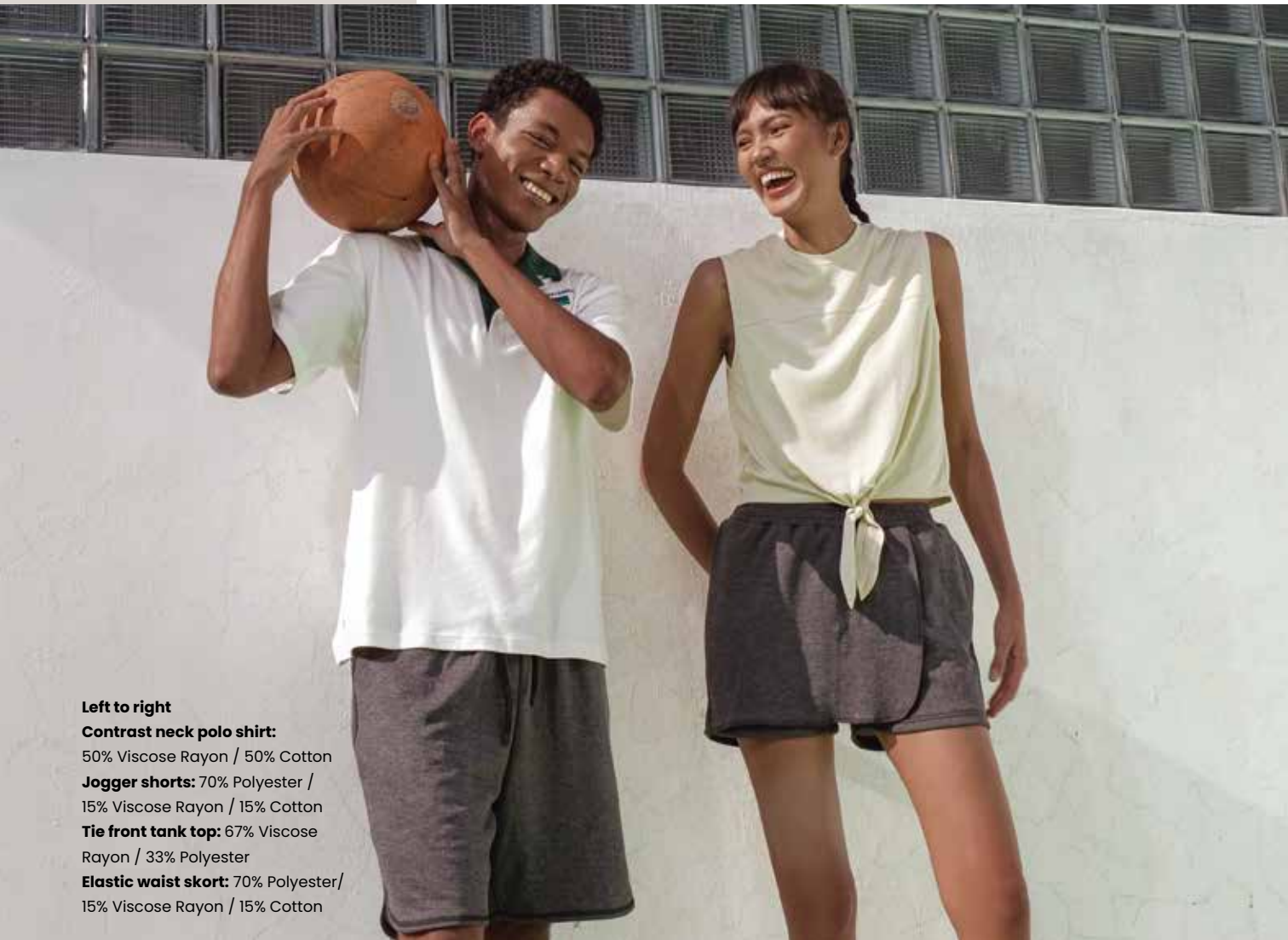
Left to right Contrast neck polo shirt: 50% Viscose Rayon / 50% Cotton Jogger shorts: 70% Polyester / 15% Viscose Rayon / 15% Cotton Tie front tank top: 67% Viscose Rayon / 33% Polyester Elastic waist skort: 70% Polyester / 15% Viscose Rayon / 15% Cotton

Once considered exclusive, sports like tennis and golf are now becoming more accessible to everyone, prompting a reexamination of their traditional uniforms with a nostalgic, retro sports perspective, inspiring both graphics and silhouettes. The increasing popularity of racquet sports such as tennis has created a demand for stylish outfits suitable for both playing and socializing.