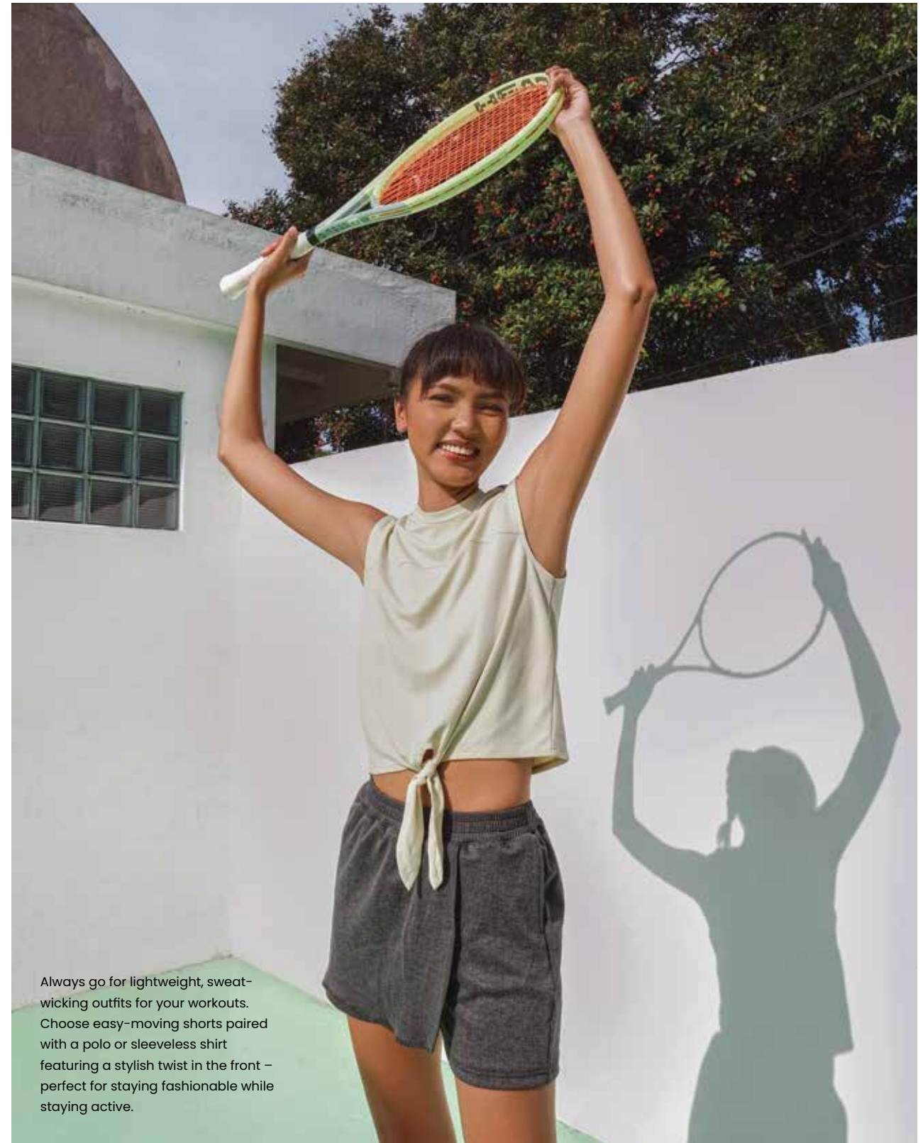
Always go for lightweight, sweat-wicking outfits for your workouts. Choose easy-moving shorts paired with a polo or sleeveless shirt featuring a stylish twist in the front – perfect for staying fashionable while staying active.

Additionally, as basketball gains traction on a global scale, we can expect to see new playing styles, celebrations of the sport and diverse cultural influences. With basketball's widespread appeal transcending borders, its influence is becoming synonymous with street style, seamlessly blending the court and the street.