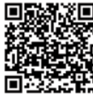
Scan this barcode to watch the photoshoot video

Viscose rayon blends effortlessly with everyday and uncomplicated fashions, highlighting the communal ties and shared moments we value. Whether through comfortable shirts or cozy jeans, the essence of community and connection is threaded into every stitch of our casual attire, reminding us of the beauty of coming together.