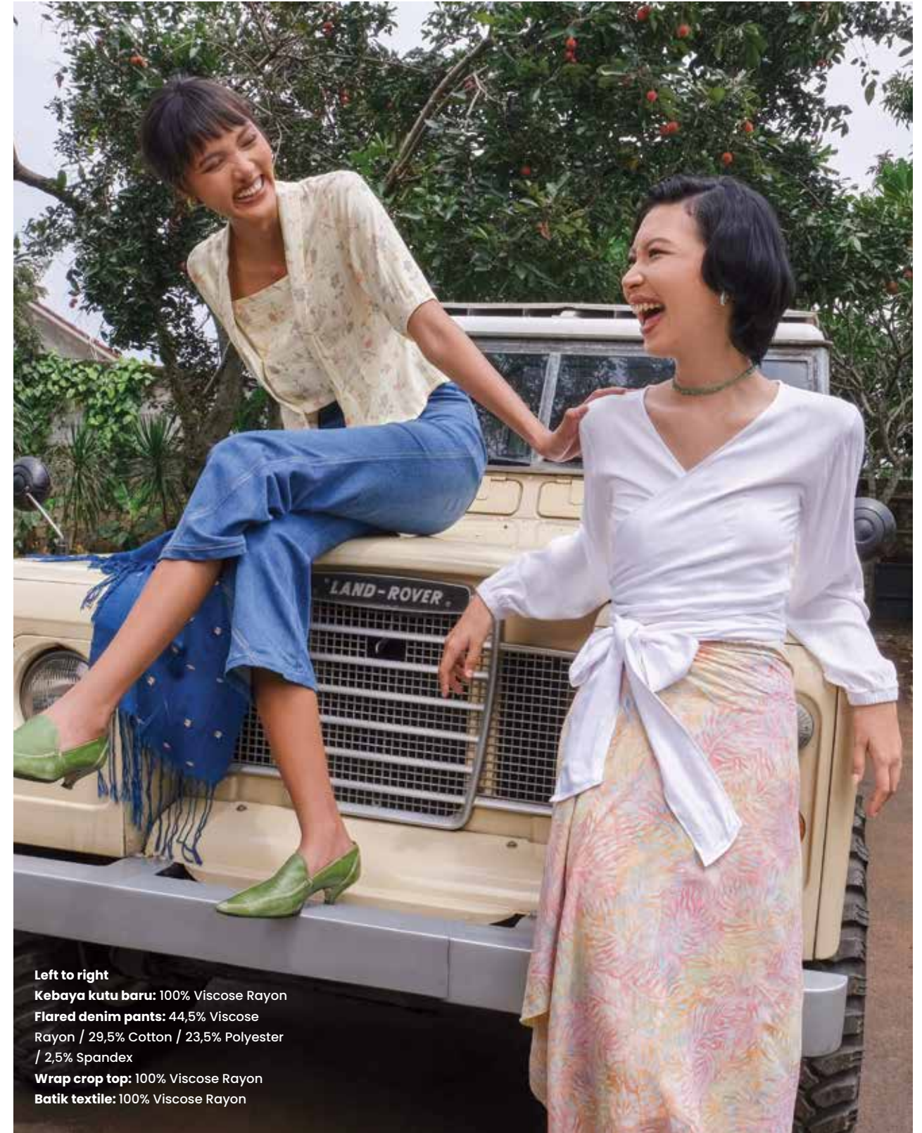
Left to right Kebaya kutu baru: 100% Viscose Rayon Flared denim pants: 44,5% Viscose Rayon / 29,5% Cotton / 23,5% Polyester / 2,5% Spandex Wrap crop top: 100% Viscose Rayon Batik textile: 100% Viscose Rayon

Through social media, young Indonesians proudly flaunt their batik pieces, often paired with contemporary elements like sneakers and t-shirts, showcasing a fusion of tradition and modernity.